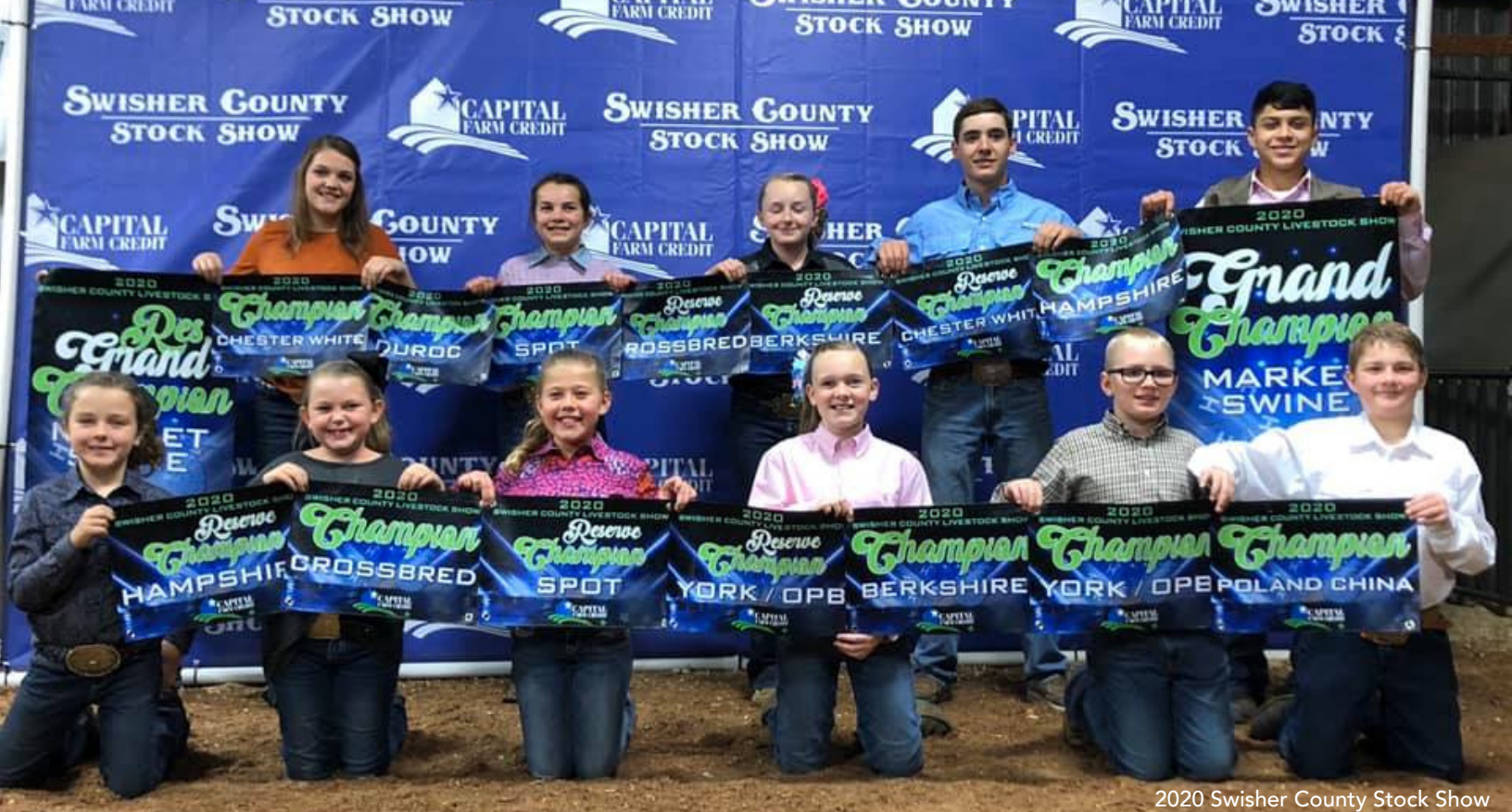
2020 Swisher County Stock Show