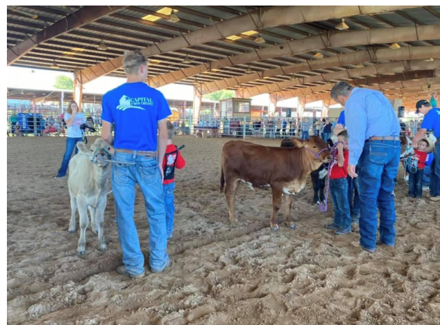
2020 Washington County Fair Bucket Calf Show

CFC proudly sponsors world champion barrel racer Hailey Kinsel Lockwood. We are honored to have her as a member of #teamCFC and #AgrInsurance.