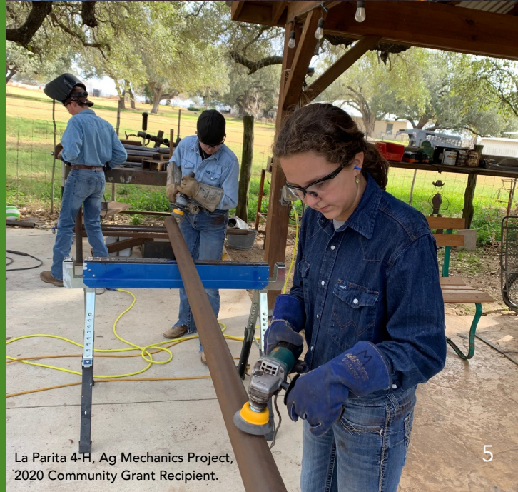
La Parita 4-H, Ag Mechanics Project, 2020 Community Grant Recipient.