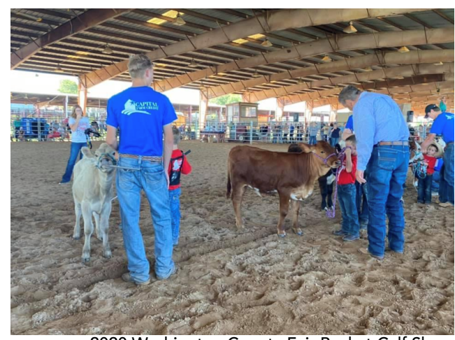
2020 Washington County Fair Bucket Calf Show

We do our part to sponsor events and exhibitors, contributing to the success of livestock shows and rodeos.