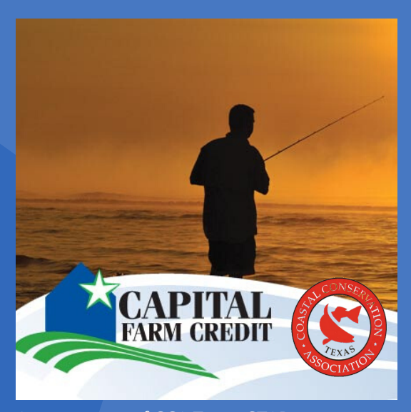
As a sponsor of CCA Texas STAR Tournament, CFC stands alongside CCA's membership and the great work they do for conservation and stewardship of our natural resources.

At CFC we are not only ag lenders, we are defenders of the foundations of our American way of life. Our love for the land of Texas runs deep. Together, we look for ways to give back to the state we call home. To grow. To impact. To innovate.