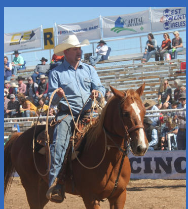
STOCK SHOWS & RODEOS